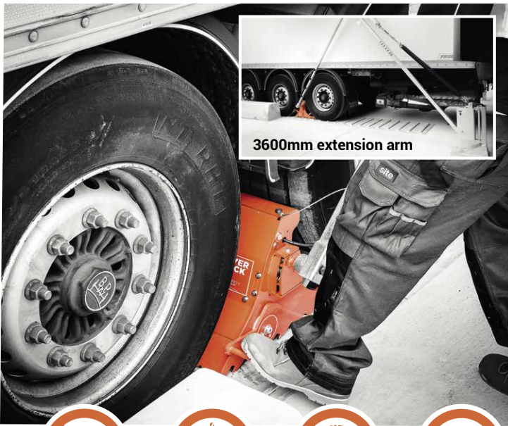
3600mm extension arm